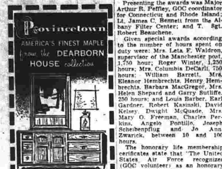
AMERICA'S FINEST MAPLE HOUSE... THE DEARBORN HOUSE... COLLECTOR'S ITEM $4.99

More than one hundred honorary life membership certificates and 19 special awards were given out last night at the final meeting of the Manchester observation post of the Skywatch Club.